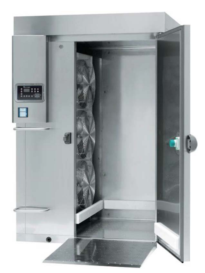
Shown with optional printer.