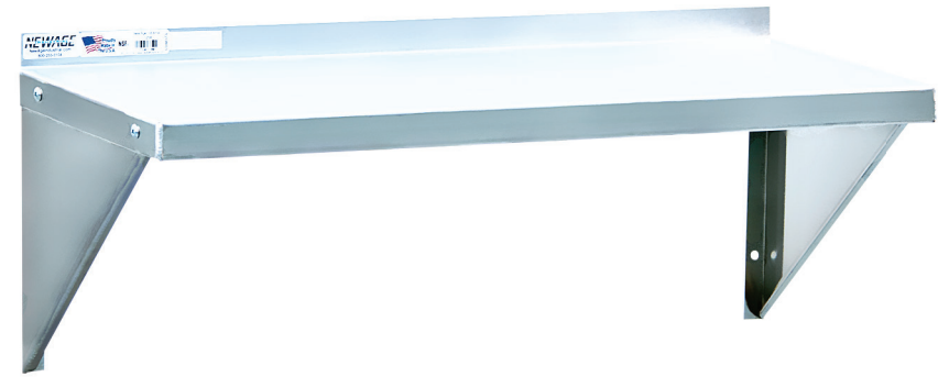
Solid Wall Shelf • H.D. & Standard