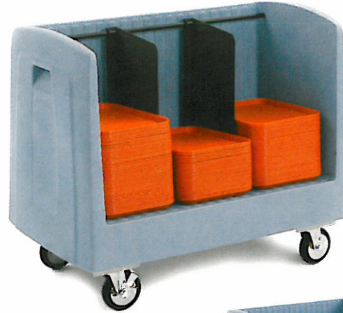
Model SSD16 Shown above with Optional Divider Accessory A110