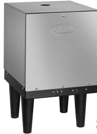
Model MC-10 on 6" (152 mm) legs