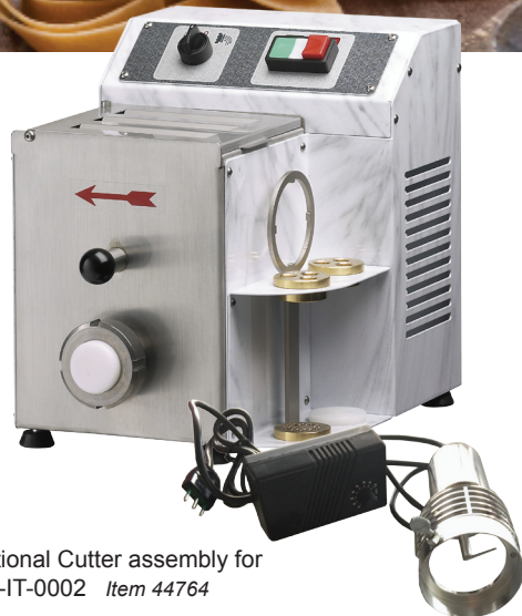
Optional Cutter assembly for PM-IT-0002 Item 44764