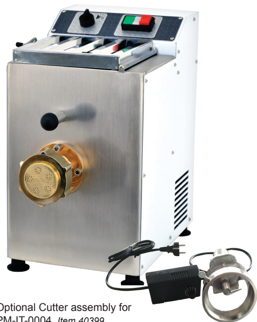
Optional Cutter assembly for PM-IT-0004 Item 40399