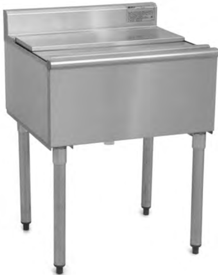
B21C-22 ice chest

Eagle 2200 Series Ice Chests, model _____. Top, front, backsplash, fabricated ice bin and sliding cover are heavy gauge type 304 stainless steel. Ice bin is fully insulated, with 1½" drain. 1½" O.D. galvanized tubular legs with adjustable bullet feet.