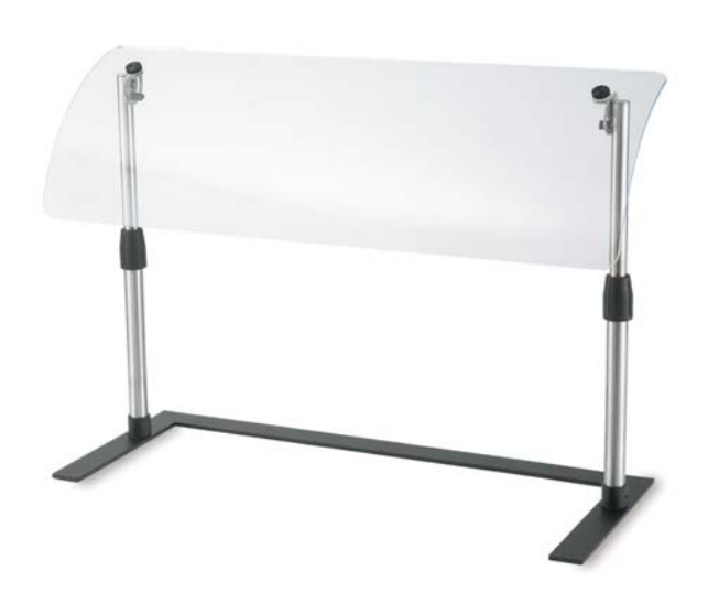
Mobile Breath Guards