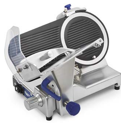
Heavy-Duty Electric Slicer