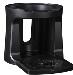
STAND ASSY KIT, TF SERVER