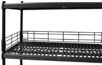
*Green Epoxy Style