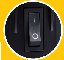
On/Off Switch Located on back of unit

All commercial urns share the same features except for tank size