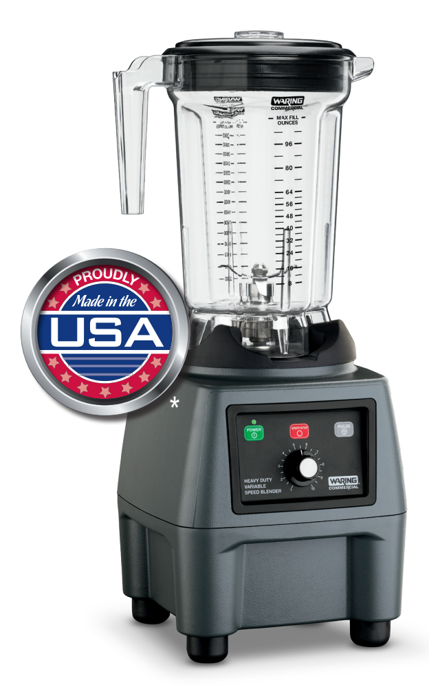
*Made in USA with US and foreign parts.