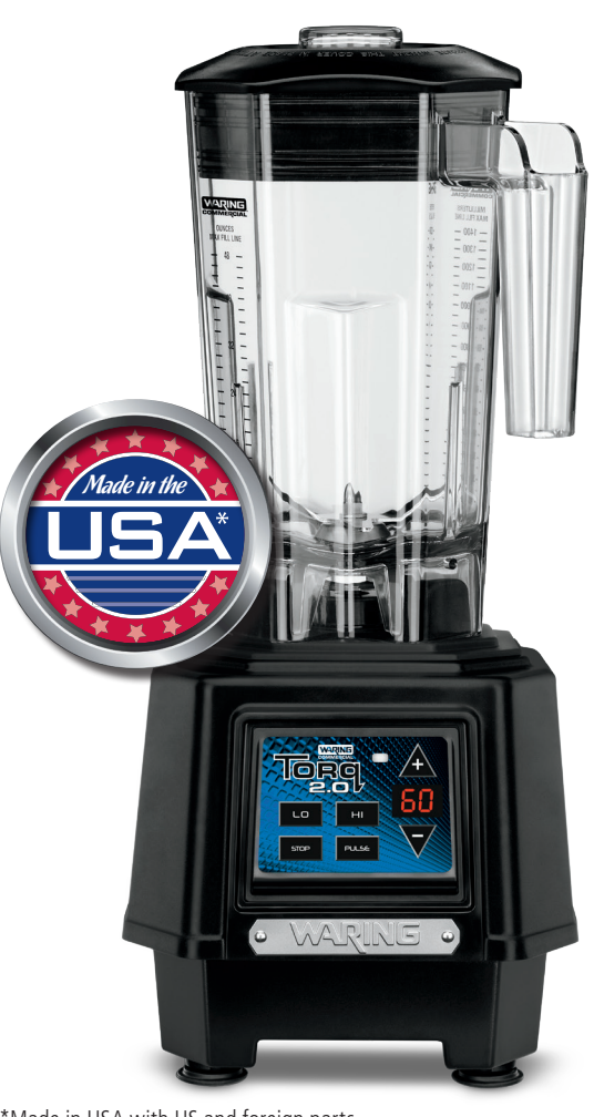
*Made in USA with US and foreign parts.