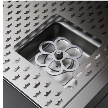
Built-in Glass Froster unit