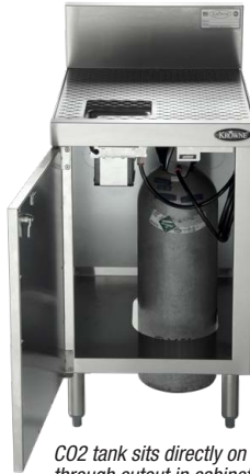
CO2 tank sits directly on floor through cutout in cabinet bottom. (CO2 Tank not included)