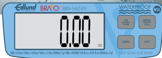
More comprehensive display options