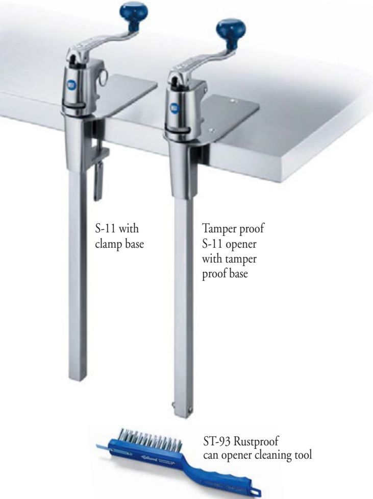
S-11 with clamp base