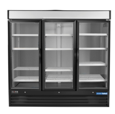
69K-059 (Color: Black)