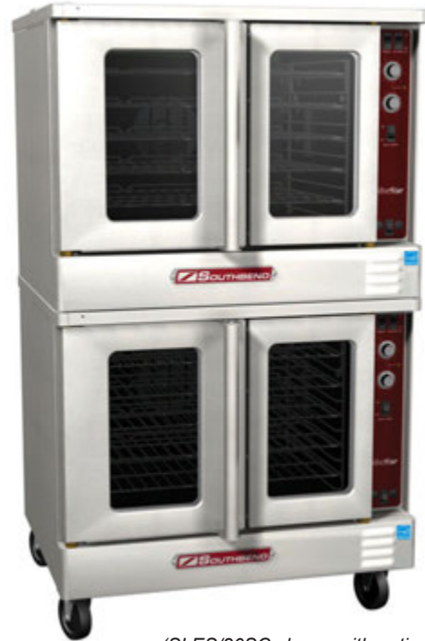
(SLES/20SC shown with optional casters)

SLES/20SC, SLES/20CCH SLEB/20SC, SLEB/20CCH