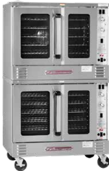
SLGS/22SC shown with optional casters

OPTIONAL NRG System required for rebates. NRG System units are Energy Star Approved. (Standard Depth Only)