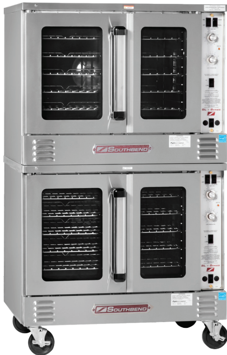
SLES/20SC shown with optional casters