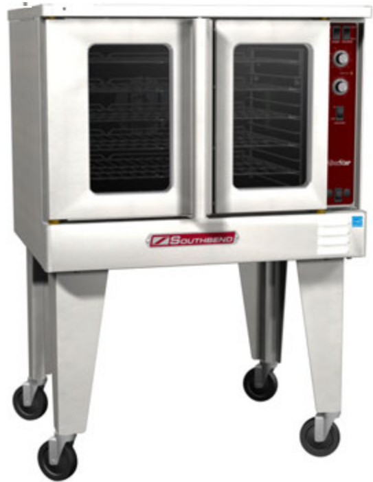
(SLES/10SC shown with optional casters)

SLES/10SC, SLES/10CCH SLEB/10SC, SLEB/10CCH