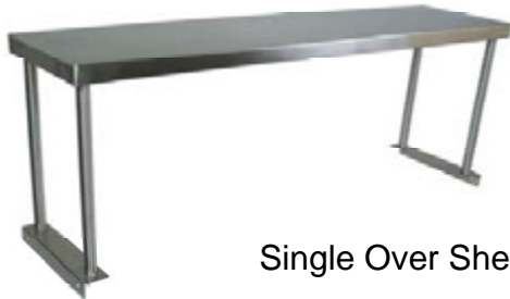
Single Over Shelf