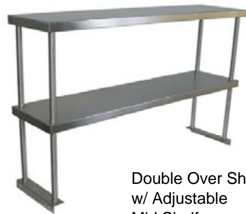
Double Over Shelf w/ Adjustable Mid Shelf