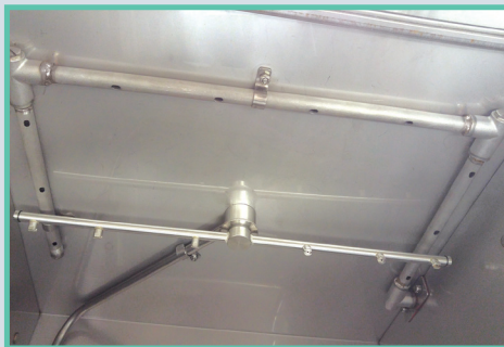
Halo Wash Arm

The DishStar HT-E-SEER provides exceptional cleaning performance and high-temperature sanitizing while consuming only 0.60 gallons of water per rack. The Steam Elimination and Energy Recovery System collects the hot water vapor generated during the wash and rinse cycles and uses it to preheat the incoming rinse water. This allows the machine to operate from a cold water supply only, saving energy and reducing steam to improve the operator's experience. Simple to operate with automatic fill, push button start, and three selectable cycles for Normal, Heavy, and Extra Heavy soil loads. Perfect for coffee shops, bars, quick service restaurants, small healthcare facilities, day care centers, and convenience stores.