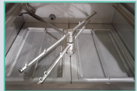
Interchangeable Scrap Baskets