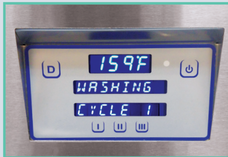
Digital LED Control Panel