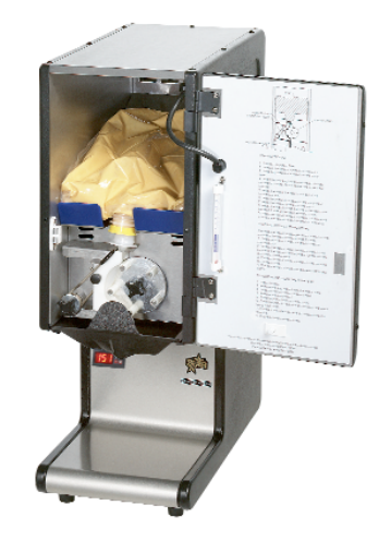
Model HPDE1 (cheese not included)

Star's peristaltic dispensers are covered by Star's one year parts and labor warranty.