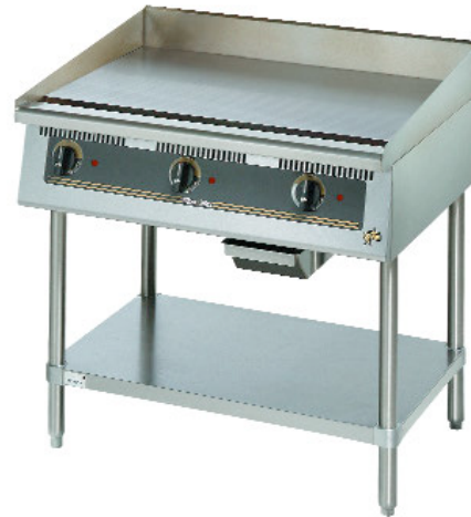
Model 736T Shown with Optional Floor Stand