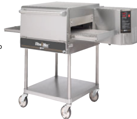
UM-1854 (Single) with Optional Stand