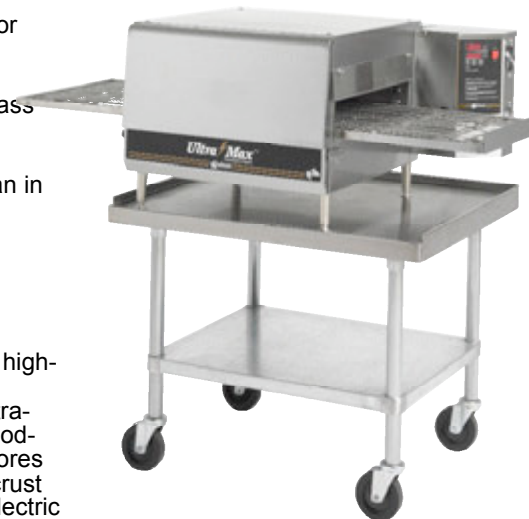
UM-1850A with Optional Stand