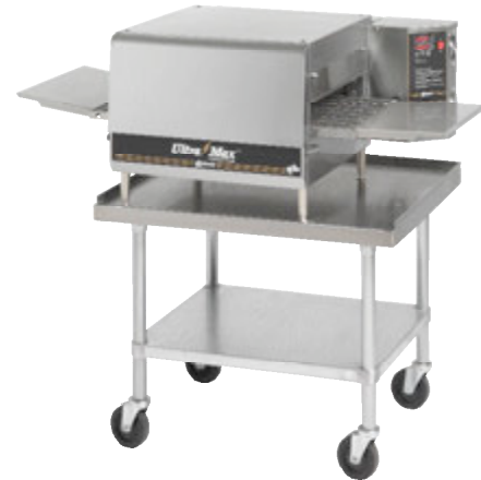
UM-1833A with Optional Stand

Star's Holman Ultra-Max electric conveyor ovens are covered by Star's one year parts and labor warranty.