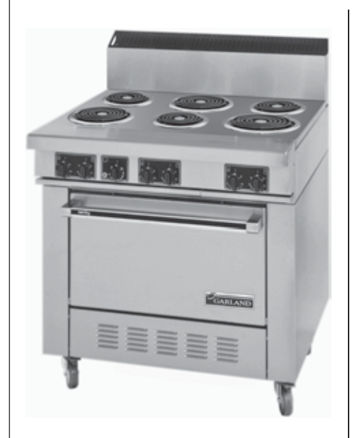
Model S686 (shown with optional casters)

NOTE: Ranges supplied with casters must be installed with an approved restraining device.