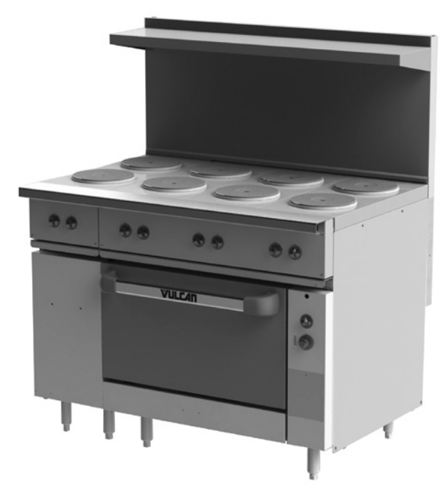
Model EV48S-8FP208 shown with adjustable legs