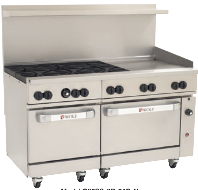
Model C60SS-6B-24G-N (shown with optional casters)

6 OPEN BURNERS / 24" GRIDDLE 60" WIDE GAS RANGE