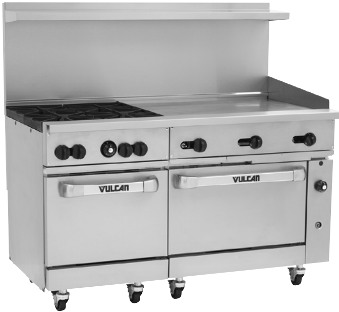
Model 60SS-4B-36G-N (shown with optional casters)