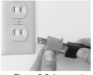
Figure 8-2 Incorrect