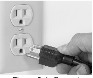
Figure 8-1 Correct

THIS MACHINE IS PROVIDED WITH A THREE-PRONG GROUNDING PLUG. THE OUTLET TO WHICH THIS PLUG IS CONNECTED MUST BE PROPERLY GROUNDED. IF THE RECEPTACLE IS NOT THE PROPER GROUNDING TYPE, CONTACT AN ELECTRICIAN. DO NOT UNDER ANY CIRCUMSTANCES CUT OR REMOVE THE THIRD GROUND PRONG FROM THE POWER CORD OR USE ANY ADAPTER PLUG (Figure 8-1 and Figure 8-2).