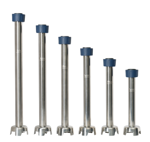
Available in stick lengths 12-22"