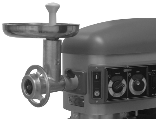
CHOPPER ATTACHMENT on a MIXER

NOTICE This product must not be used for preparation of bread crumbs.