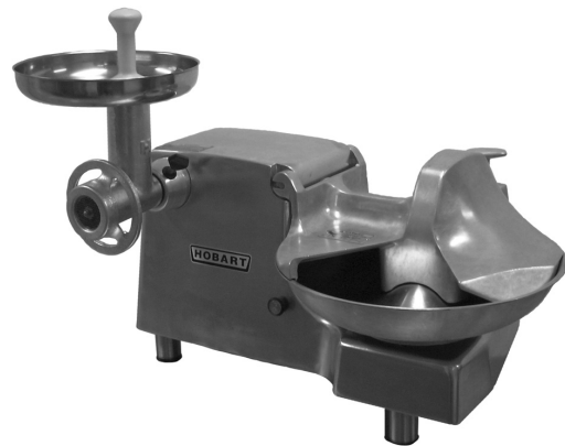
CHOPPER ATTACHMENT on a FOOD CUTTER