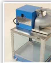
Polycarbonate Service Door