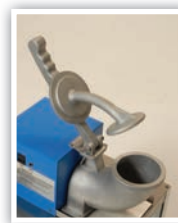
Cast Aluminum Assembly