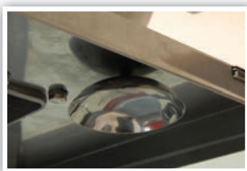
Convenient Snow Cone Shaper