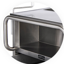
Heated Plate Shelf with own control dial

(to be ordered when cart is initially purchased)