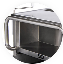
Heated Plate Shelf with own control dial

(to be ordered when cart is initially purchased)