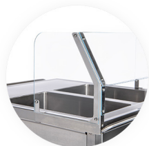
Sneeze Guard Removable