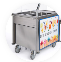
Magnetic themed panels Easy on/off