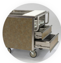
Laminate decor panel Many colors available