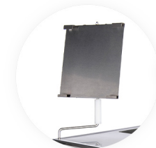
Binder Holder Removable