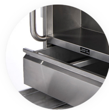
Heated Drawer with own control dial