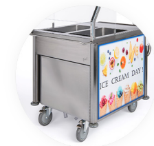
Magnetic themed panels Easy on/off