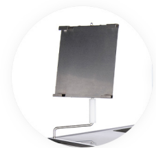
Binder Holder Removable