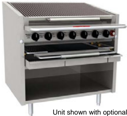
Unit shown with optional lower rack