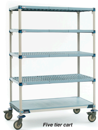
Five tier cart

Quick-to-adjust, corrosion resistant mobile shelving offers a sturdy, long lasting movable storage solution or transport cart. Rigid one-piece shelf frame with wraparound corners provides complete 360° capture of the wedge and post to ensure stability, and overall strength. Shelves have polymer shelf mats that are impact resistant for long life and quick-to-remove for easy routine cleaning. The shelf frames have a durable epoxy coating over an electroplated substrate. Shelves offer a 20 year warranty against corrosion. Rust proof polymer posts offer a lifetime warranty against corrosion. Shelf mats and posts have built-in Microban® antimicrobial product protection. Proprietary quick-release corner release enables fast, no-tool shelf adjustment. Each cart can safely store or transport 900lbs. (408kg). Units assemble easily — Shelves mount on four one-piece wedges along grooved, numbered posts. Shelves adjust on 1" (25mm) increments.