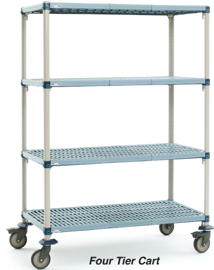
Four Tier Cart