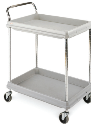
Deep Ledge Cart (2-shelf)