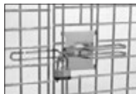
Handle (closed position)