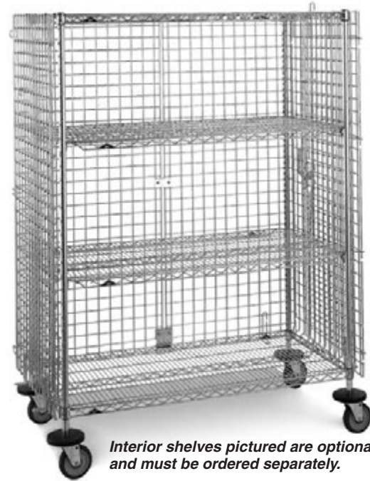
Interior shelves pictured are optional and must be ordered separately.