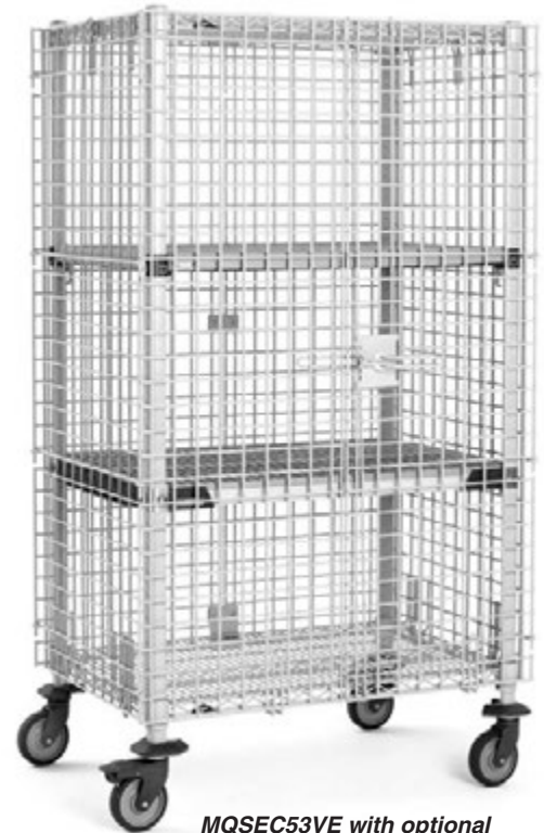
MQSEC53VE with optional intermediate shelves

Note: Leveling foot on post can be adjusted up to 1" (25mm) to compensate for uneven floors.