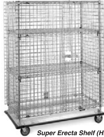
Super Erecta Shelf (HD Mobile) with optional Super Adjustable Super Erecta® Intermediate shelves