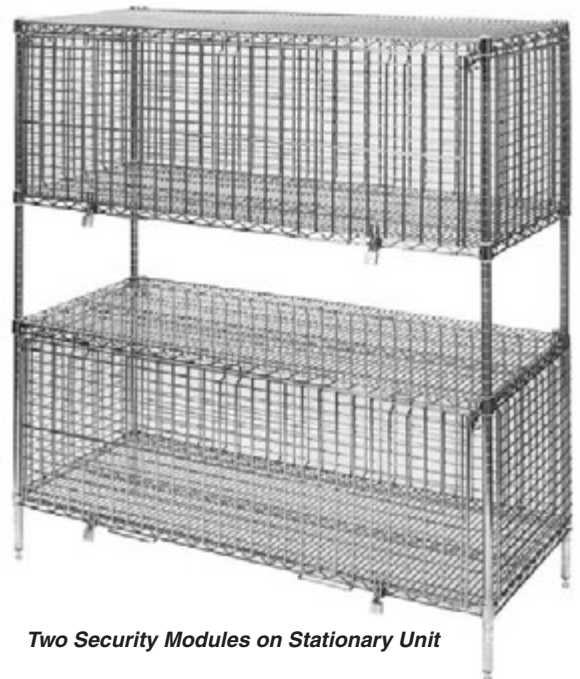
Two Security Modules on Stationary Unit