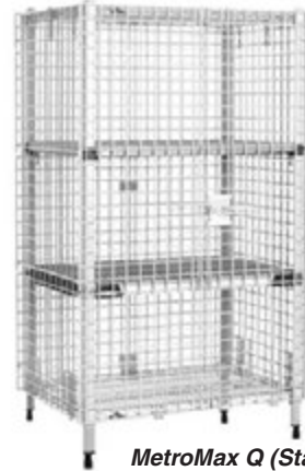
MetroMax Q (Stationary) with optional Intermediate shelves