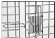
Handle (open position)