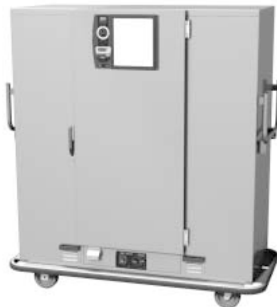
MBQ-180-QH — 180 Plate Capacity with Quad-Heat™ Dual Fuel