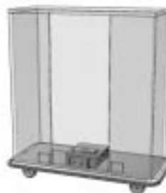
Standard Electric Thermal System