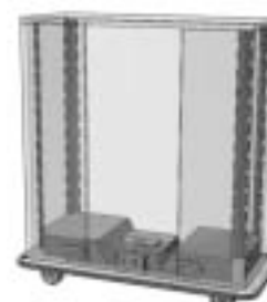
Quad-Heat™ Dual Fuel Thermal System