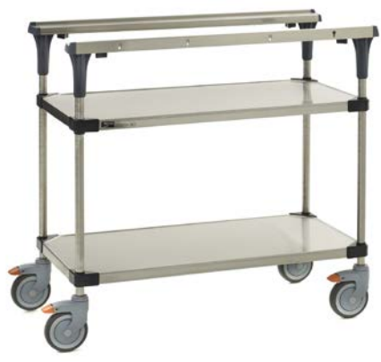
36" PrepMate shown with Solid Stainless Steel Shelves.