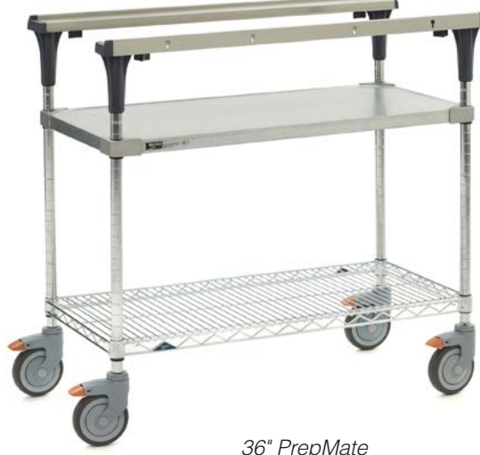
Shown with Flat Galvanized Top Shelf and Wire Bottom Shelf.