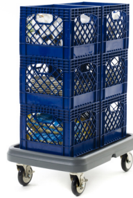
Dolly designed to hold milk crates.