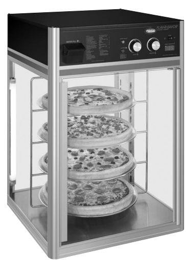
Model FSDT-1 with 4-tier circle rack and accessory pans