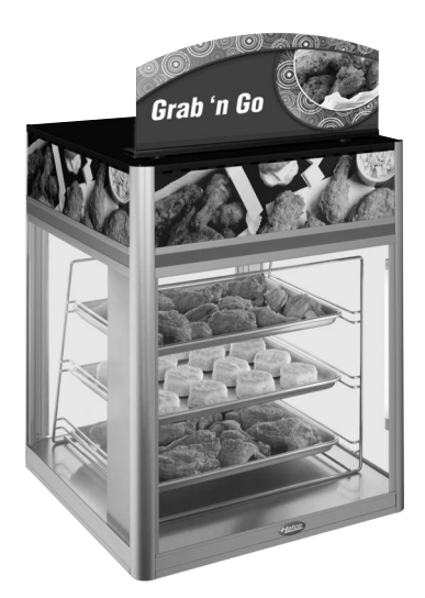
Model FSDT-1X with 3-tier pan rack and accessory decals, food pans, and sign from www.hatcographics.com

(Standard – with revolving rack) FSD-2 (Standard – without revolving rack) FSD-2X FSDT-2 (Tall – with revolving rack) FSDT-2X (Tall – without revolving rack)