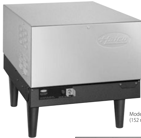
Model C-24 on 6" (152 mm) legs