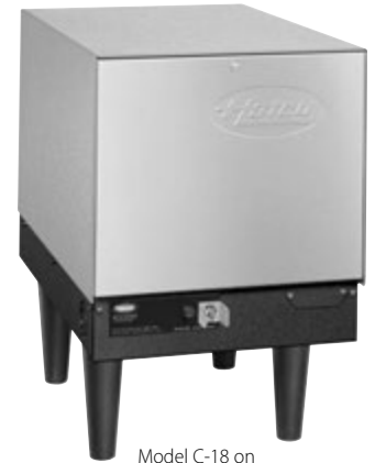
Model C-18 on 6" (152 mm) legs