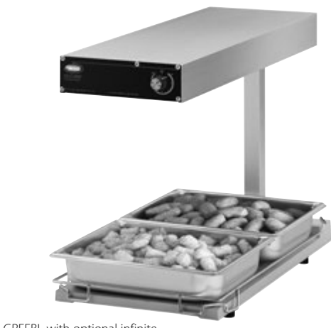
Model GRFFBL with optional infinite control and accessory half-size food pans and wire trivets