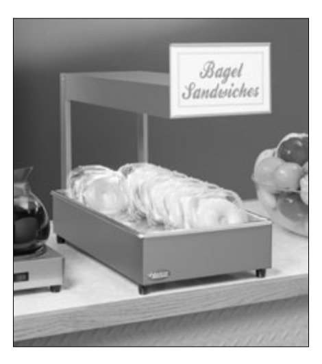
Model GRFFL with optional 9"W x 5.5"H (229 x 140 mm) display sign holder (sign not included), Designer color and accessory food pan