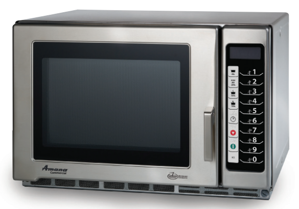
Model RFS18TS shown