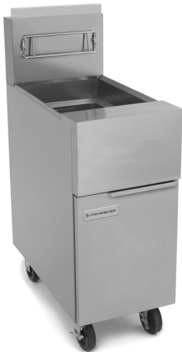
GF40 Shown with casters