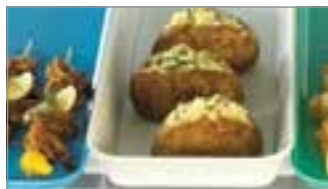
Market Pans showcase deli items.