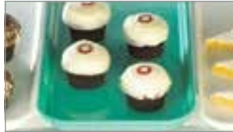
Market Trays make appealing bakery merchandising quick and easy.